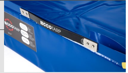
Detail of side handle