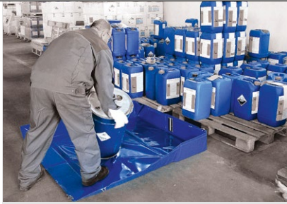
Examples of uses