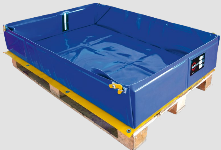
Cargo EUR without the handles

Thanks to shape and size specially designed for use in industry and transportation