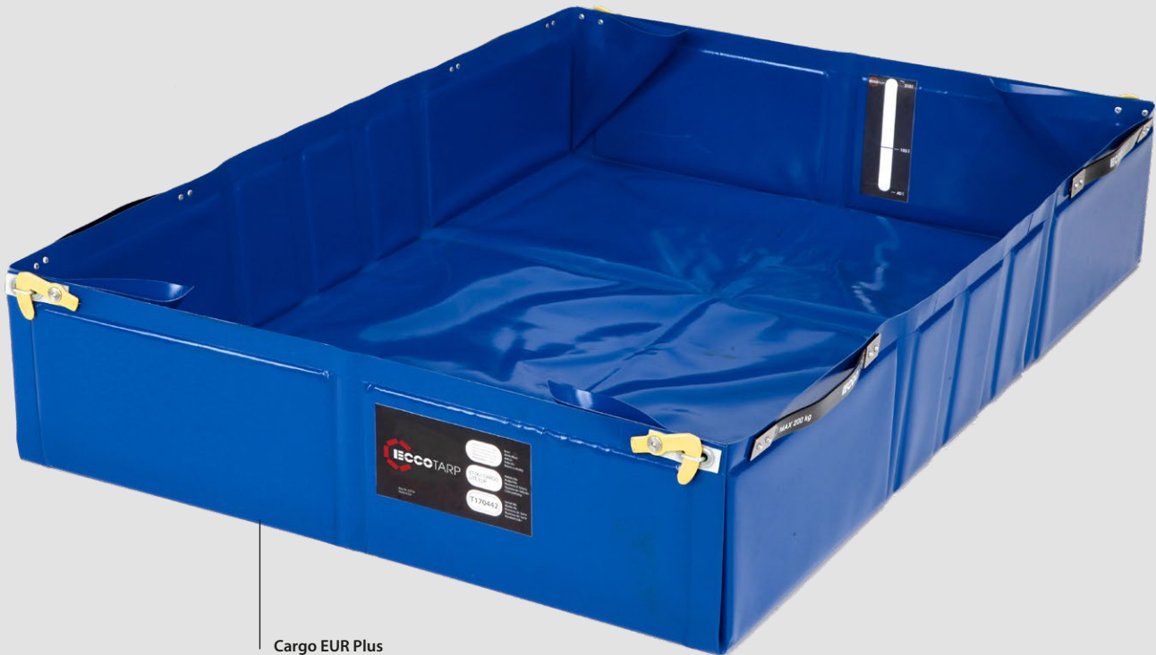
Cargo EUR Plus with side handles