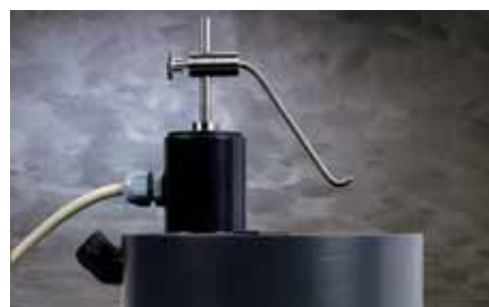
The tank mount serves as a platform for the specimen. Easily exchangeable masks allow the preparation of differently sized specimen-areas.