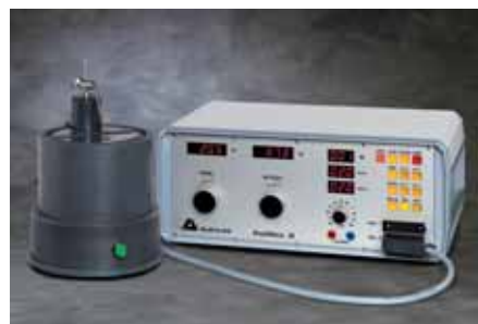
The PoliMat 2 consists of two components, the controller and power supply unit and the electrolytic cell. The controller is built into a robust metal housing. Preparation parameters can be adjusted separately.

Most metallic material, with the exception of stainless steel, can be etched after the polishing process with the same electrolyte.