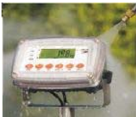
Indicator KPZ 51E-34K

Certification: EC approval possibility class III, Declaration of Conformity.