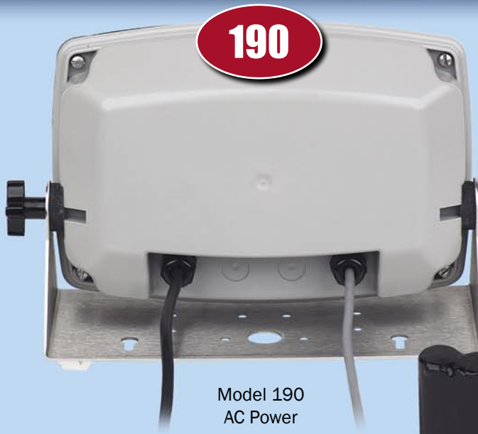
Model 190 AC Power