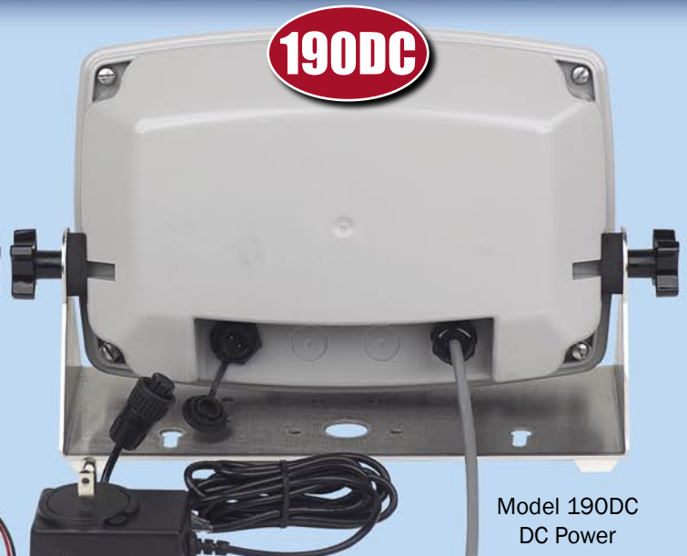
Model 190DC DC Power

Both the 190 and 190DC may utilize an optional rechargeable Lithium Ion battery.