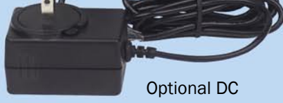
Optional DC Power Supply