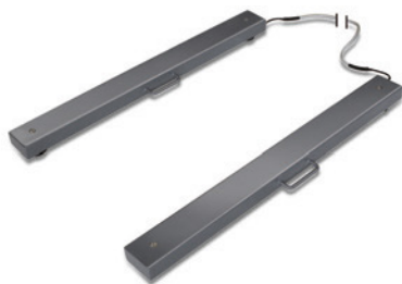
4 KERN KFA-V20