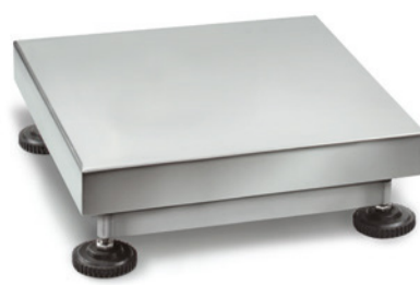
6 KERN KFP-V30